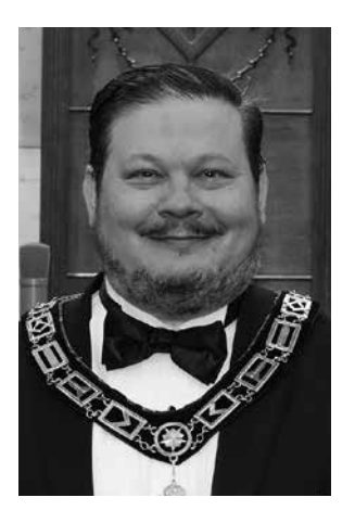
Greetings My Brothers,

For all those who assisted and attended, I thank you for making our first Family Night of 2014 a big success! It continues to be my pleasure to provide refreshment and nourishment to the Craft and our guests. We still have several upcoming meetings when volunteer cooks will prepare a special meal. Please check the list on the kitchen door, and come out to show your support for these Brothers.