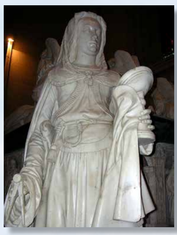
Prudence holds in her right hand a compass, a symbol of the extent of any action, and in her left hand a mirror, reflecting every thought back to be contemplated and assessed before the wisdom of the ages.

Degrees on 1st and 3rd Tuesdays Stated Communications on 2nd and 4th Tuesdays Masonic Instruction every Thursday Eastern Star meets on 1st and 3rd Saturdays DeMolay meets every Monday