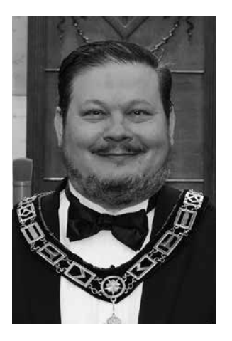
Greetings, My Brothers,

Now that we are approaching the end of the first quarter, the year is in full swing, and the kitchen is firing on all eight cylinders! Several Brothers have offered to cook meals, so I think we are all in for a nice variety of refreshments this year.