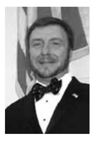
Happy September Brothers All,

It is great to get back to work after being dark. What an awesome first half of the year with many new Mason's learning their work and becoming active in degree work. The degree teams have done a spectacular job as well. There have been many new faces in chairs and it is great to see the zeal and dedication of those brothers and living what we have all been taught.