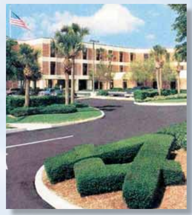
The Masonic Home of Florida provides an exceptional living experience with all the amenities while providing state-of-the-art medical care for those residents who need it.

The Masonic Home of Florida has reinvented the art of graceful living. Senior Masons and their wives or widows enjoy the comfort of home in a charming