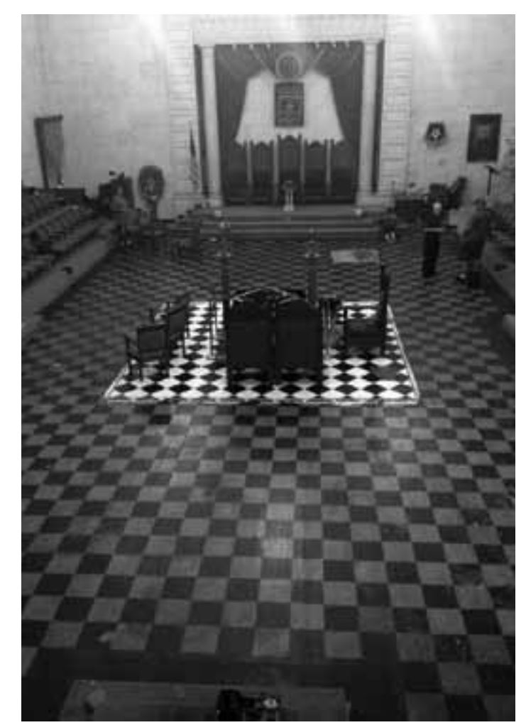
For those who missed it, we briefly lifted the veil of our historic old Lodge while replacing the carpet. Several installations of Mosaic Tile were evident.

http://www.masonic-lodge-of-education.com/mosaic-pavement.html